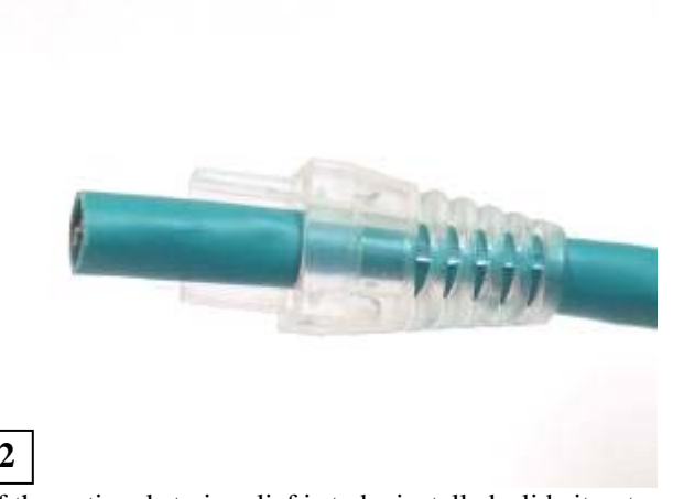
If the optional strain relief is to be installed, slide it onto the cable now.