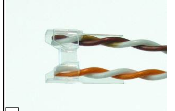
Insert the orange and brown pairs into the wire separator.