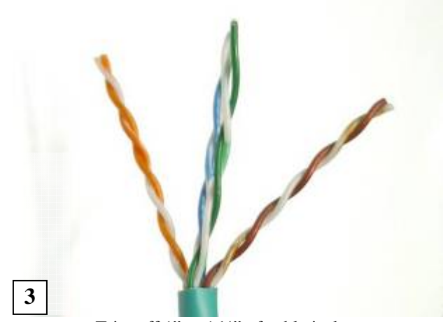
Trim off 1" to 1 ½" of cable jacket. Spread the twisted pairs. Place orange on the left and brown on the right.