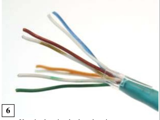
Untwist the wires back to the wire separator.

Slide the wire separator to the end of the cable jacket. The green and blue pairs should be in the center grooves on opposite sides from one another.